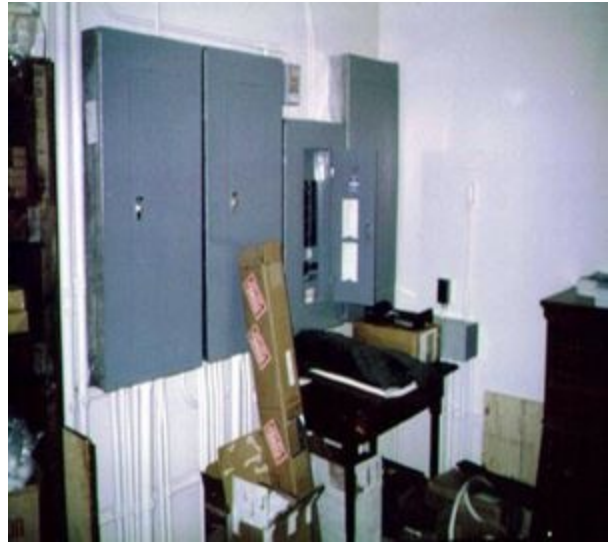
Blocked electrical panel in QA lab