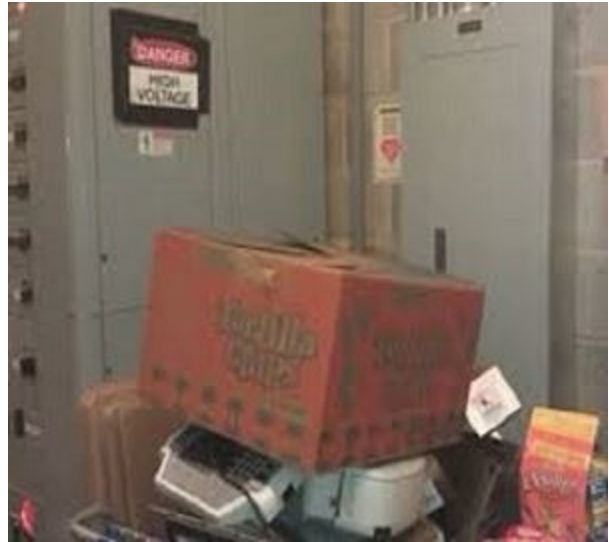
Poor housekeeping in MCC2