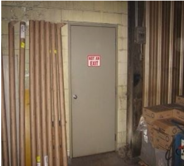
Door to storage closet in basement is properly marked NOT AN EXIT