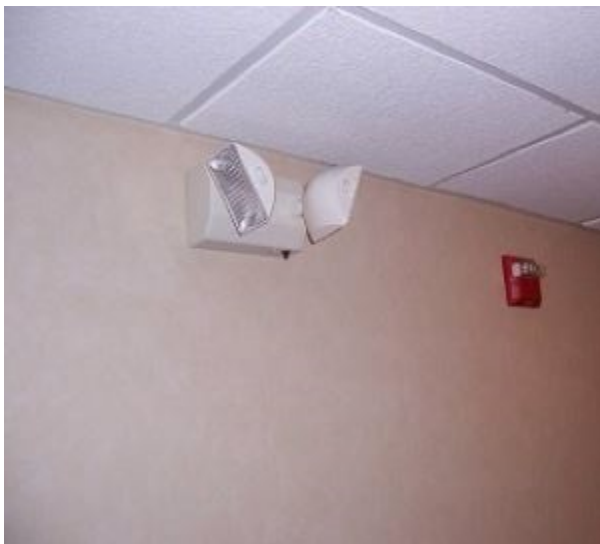
Emergency lights outside Breakroom are not working