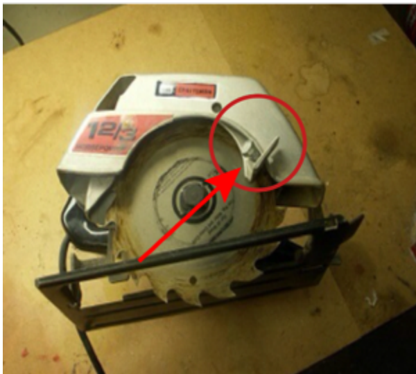
Bolt is being able send to bypass guard