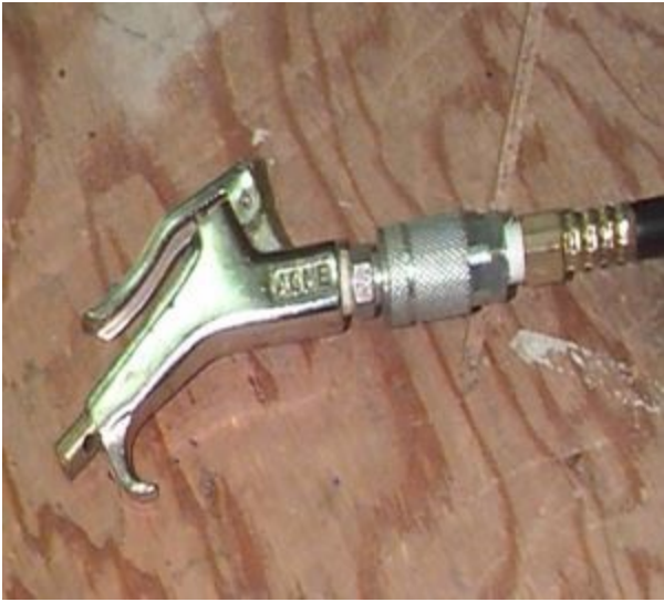
Example of compliant air nozzle in shipping