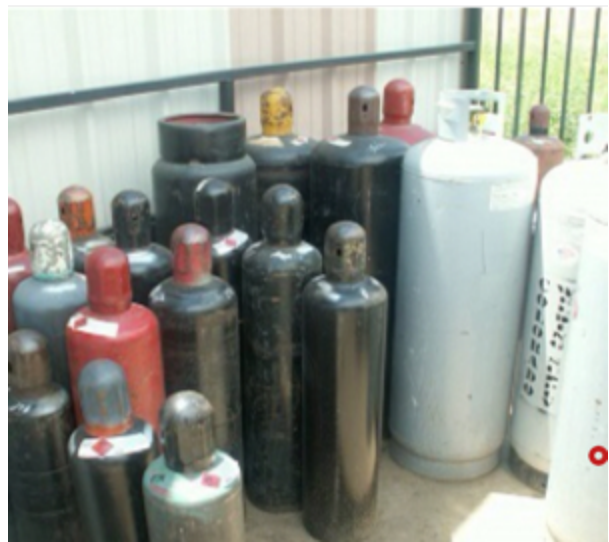
Example of cylinders NOT stored properly