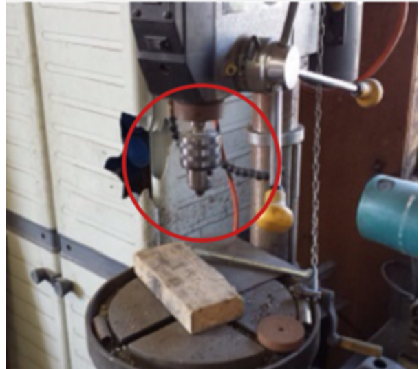
Drill press in Maintenance Shop needs a chuck guard