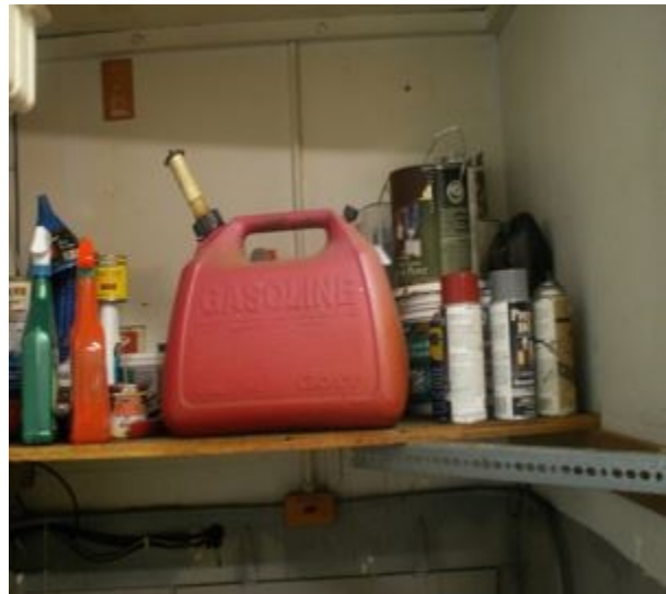
More flammable storage cabinets are needed