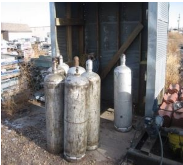
Example of cylinders NOT stored properly