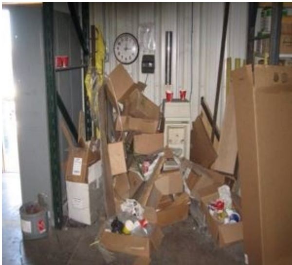
Are you kidding me!?