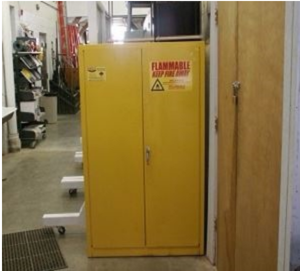
Proper chemical storage near Maintenance area