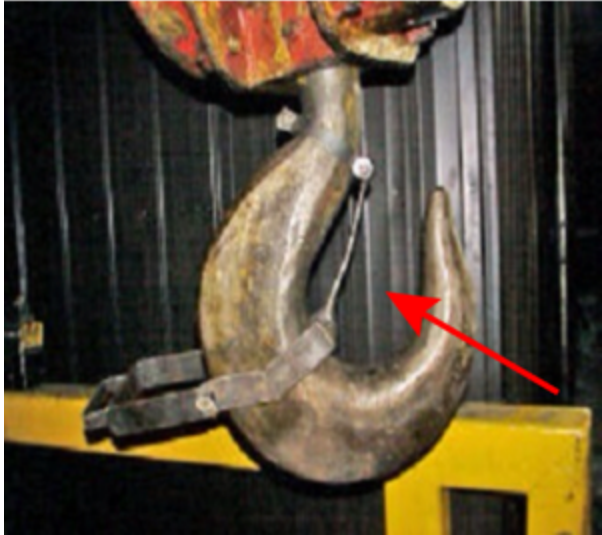
Safety latch is broken - East bay