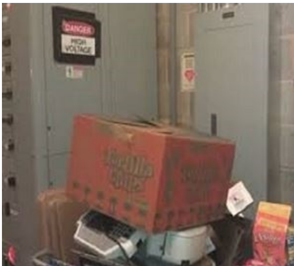
Blocked electrical panels in MCC2