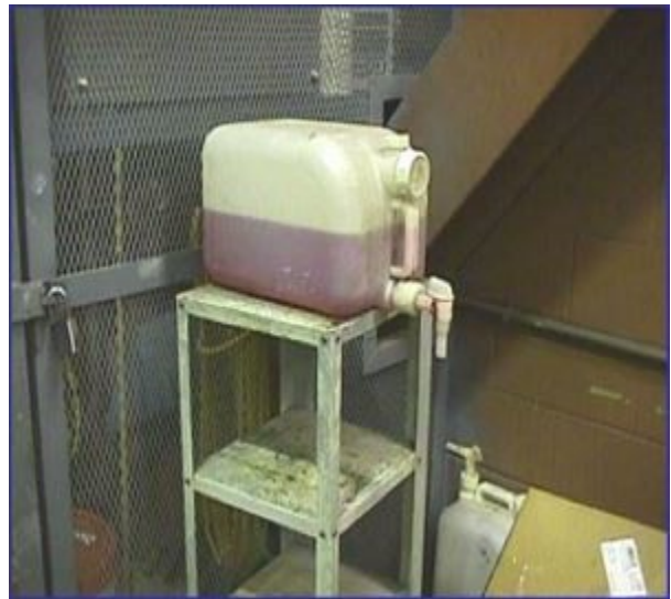
Need HMIS label