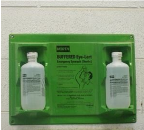
Non approved eye wash and bottles were expired