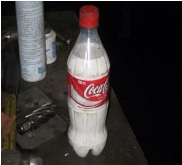
Cutting fluid in soda bottle? Seriously?