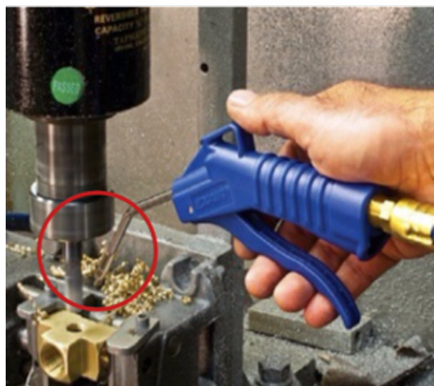
Non-compliant air nozzle