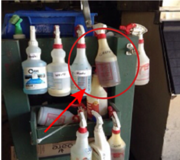
Secondary containers not properly labeled