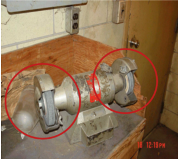
Guards not adjusted properly