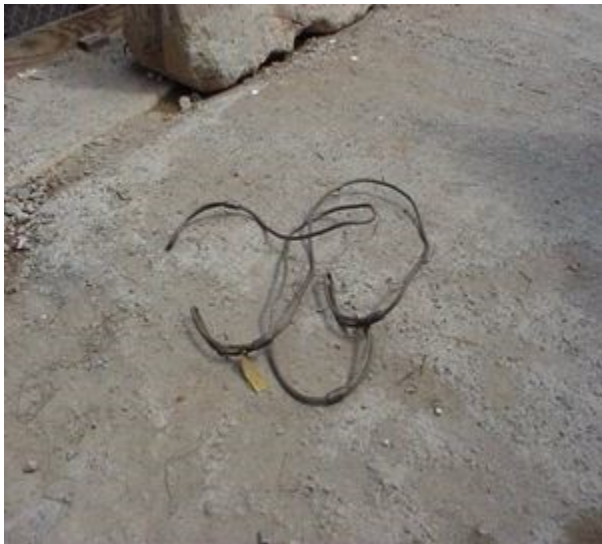
Defective wire rope sling in Yard