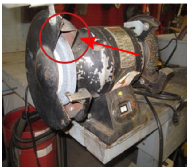
Tongue guard not adjusted properly