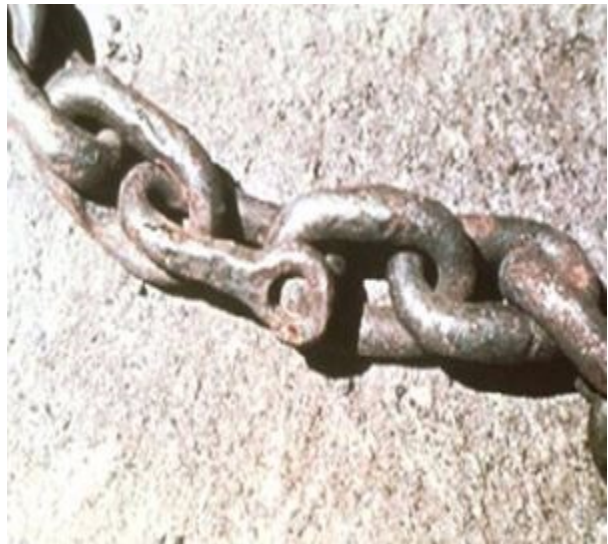
Defective chain sling in shop