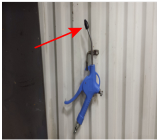
Non-compliant air nozzle