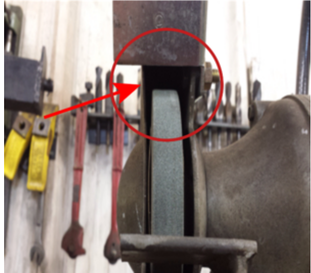
Tongue guard not adjusted properly