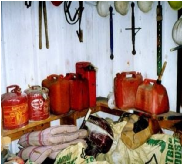
Improper storage of flammables in outside storage building