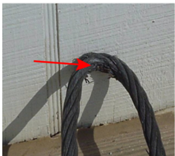
Damaged wire rope sling in shipping area