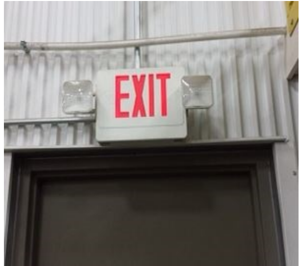
Emergency lights above door in west Bay are not working