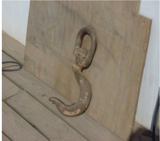
Defective lifting hook