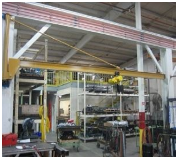
Jib crane load limits are not legible from ground