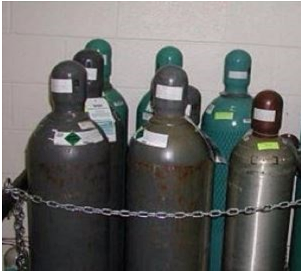
Example of proper cylinder storage