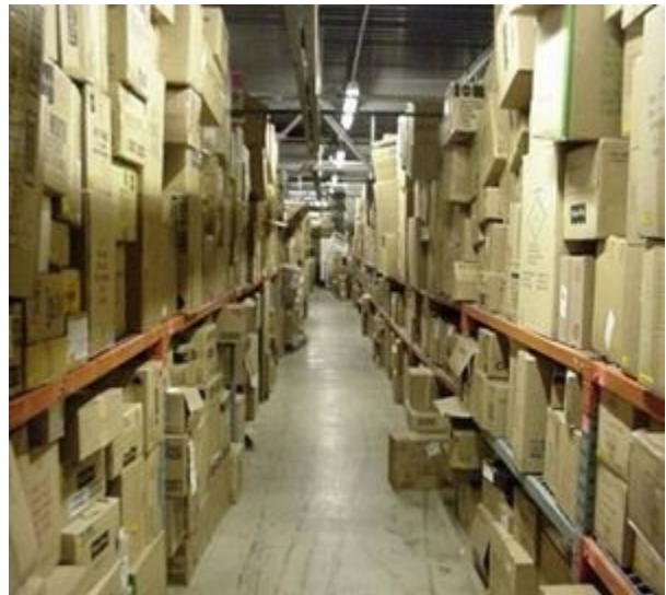
Need to address material storage issues