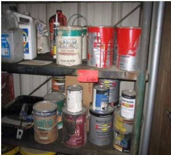
Paint shop could use two more flammable storage cabinets