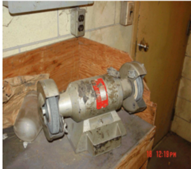
Grinder should be mounted to work bench and guards installed